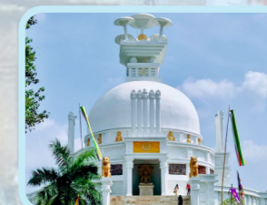
Dhauri Shanti Stupa