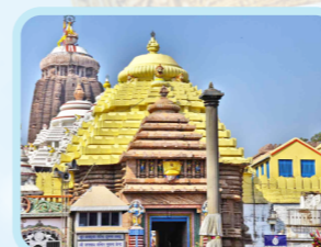
Jagannath Temple, Puri